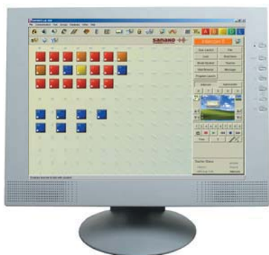
SANAKO Lab 300 Teacher Software

The Master Audio Panel contains the main power switch of the Lab 300, connectors for two external program sources, such as VCR or cassette recorders, controls for adjusting the volume, bass and treble levels for the classroom loudspeaker, and controls for adjusting volume for the headsets. The Lab 300 teacher position includes a high-quality headset.