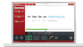
Sanako Pronounce An easy solution for improving oral skills in a foreign language