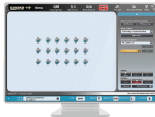
Sanako Lab 100 The affordable high performance language teaching solution