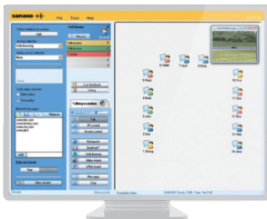
Sanako Study 1200 Advanced language lab software with classroom management